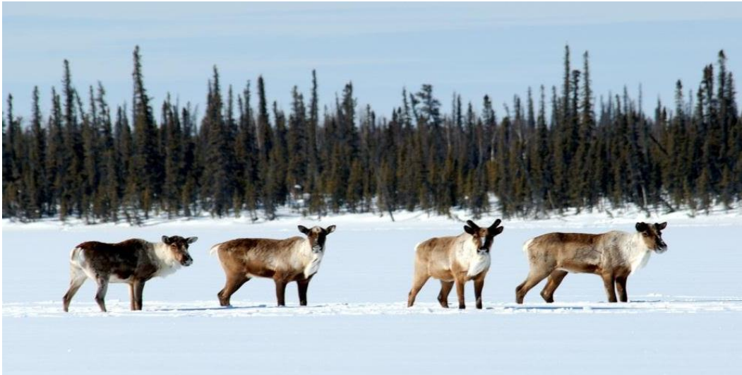
Figure 1. Photograph of boreal caribou in the NWT in 2007

Boreal caribou startle easily and are quick to run away. They can travel quickly over rough or snowy terrain. Some people refer to them as “secretive” animals because of their elusive nature and behavior.